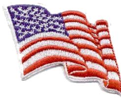
American Flag Patch