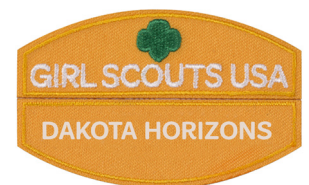
Council ID Set* "Dakota Horizons"