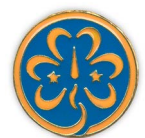
World Trefoil Pin